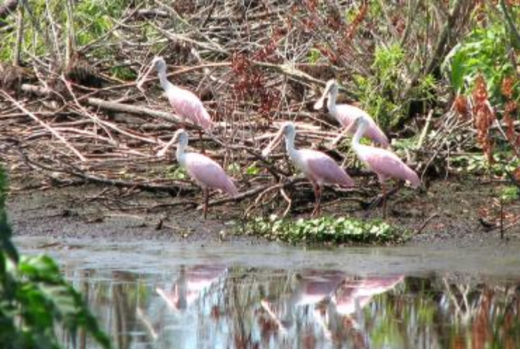
A troop of Roseate Spoonbills patrolling the edge of Lake Apopka looking for a likely spot to have lunch.