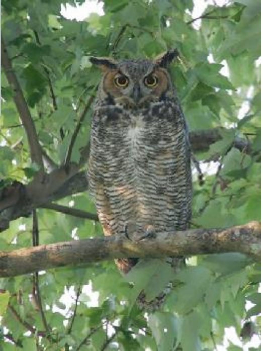
Great Horned Owls are seen from time to time in the preserve. They are large in size, from 18"-25" high with a wingspan of 36"-60" and weighing from 32-63.5 oz. They generally become active at dusk, but may be seen in late afternoon or early morning. Both male and female may be very aggressive towards intruders when nesting.

Alligators are very active this time of year and they can be seen cruising back and forth, interacting with other alligators whether it be territorial or looking for a mate or searching for food.