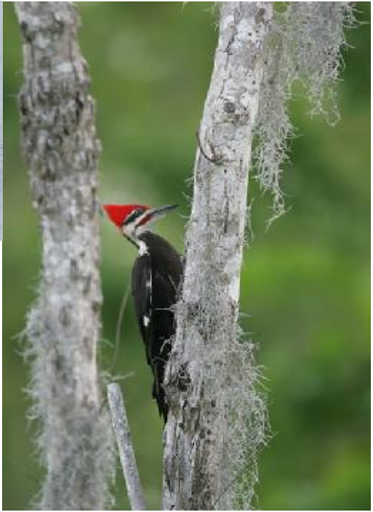
Our largest woodpecker, the Pileated Woodpecker , can be heard hammering and calling throughout the preserve. Keep an eye out for the young sticking their heads out of a cavity when the parent shows up with food. Some times they will nest in places that can be seen from the boardwalk.

Bald Eagles are nesting in the preserve though the nest can't be seen from the boardwalk. They are seen on occasion gathering nesting materials, perched on a snag, catching a fish or taking it from an Osprey.