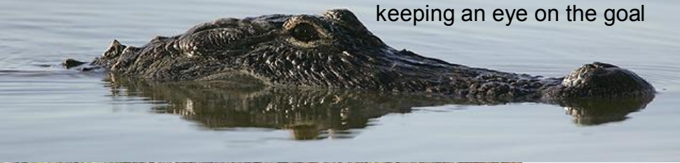
keeping an eye on the goal