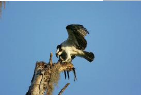
The Oakland Nature Preserve has many good parking spots for feeding Ospreys . The dead trees near the lake along the boardwalk is a great place to see them come and go with a fish in their grasp.